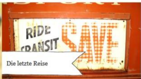
Die letzte Reise