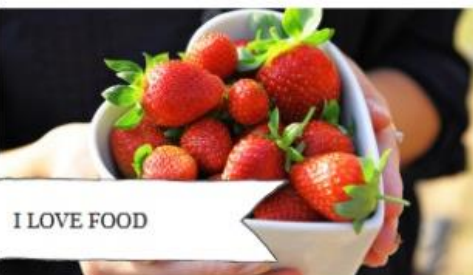
I LOVE FOOD