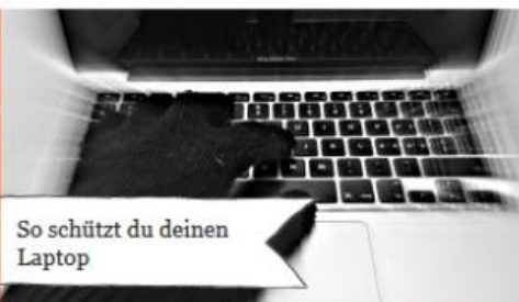
So schützt du deinen Laptop